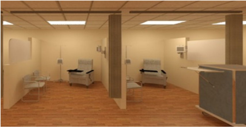
Improvements to the Cancer Center will include enlarged, private chemo infusion bays to provide more patient privacy and space for guests.